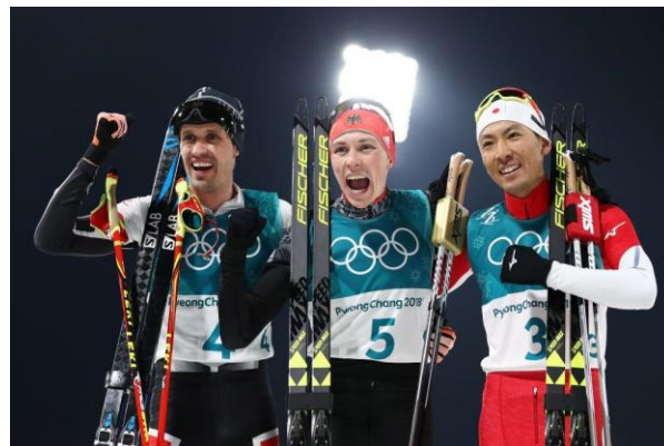
Eric Frenzel (5) ripete in fotocopia la vittoria di Sochi.

1. Eric Frenzel GER 24'51"4 (Salto [5.] 121,7; 10 km [6.] 24'15"4) 2. Akito Watabe JPN +4"8 (Salto [3.] 123,7; 10 km [9.] 24'28"2) 3. Lukas Klapfer AUT +18"1 (Salto [4.] 122,6; 10 km [11.] 24'37"5)