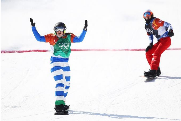
Michela Moioli vince lo SB-Cross di PyeongChang.