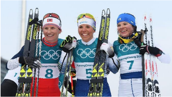
Il primo podio di PyeongChang 2018.