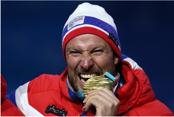
Finalmente l'oro olimpico per Aksel Svindal.