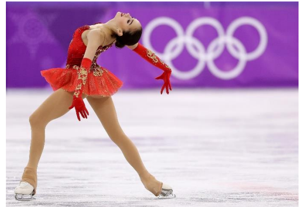
La 15.nne Alina Zagitova, primo oro per la Russia.