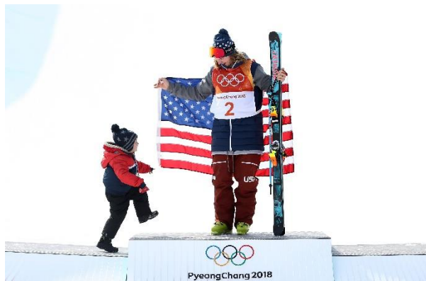
David Wise sul gradino più alto in Halfpipe.