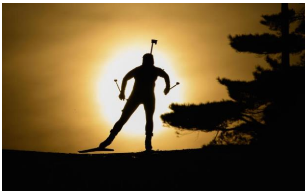
Lo svizzero Super-Dario Cologna al terzo titolo olimpico.