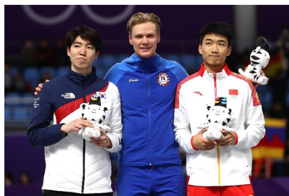
Il norvegese Havard Lorentzen sul podio dei 500.