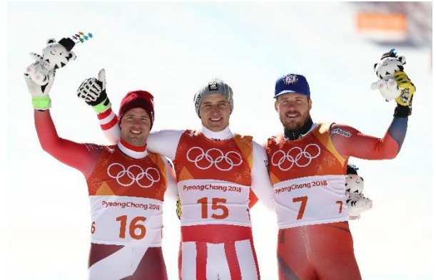
Matthias Mayer: oro in Super-G come in Discesa a Sochi.