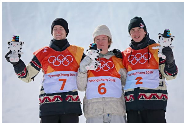
Prima medaglia d'oro degli USA su una coppia canadese.