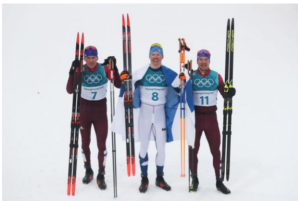
Il podio della classica 50 km vinta da Niskanen.