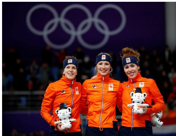
Podio tutto "orange" per i 3000 metri.