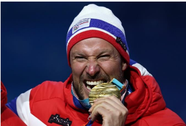
Finalmente l'oro olimpico per Aksel Svindal.