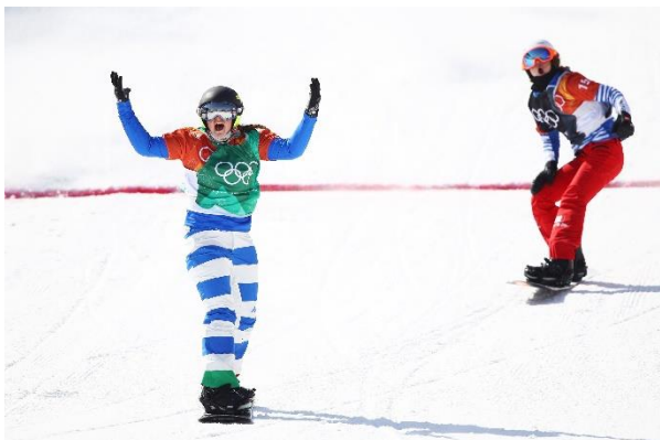
Michela Moioli vince lo SB-Cross di PyeongChang.