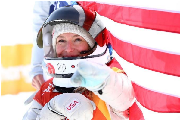
Secondo oro consecutivo per Jamie Anderson.