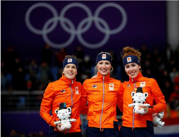
Podio tutto "orange" per i 3000 metri.