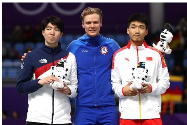
Il norvegese Havard Lorentzen sul podio dei 500.