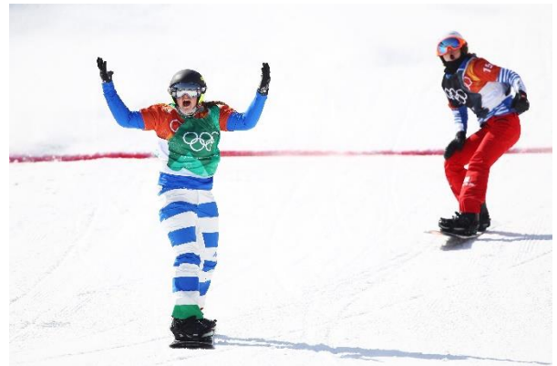
Michela Moioli vince lo SB-Cross di PyeongChang.