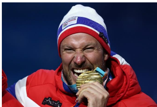
Finalmente l'oro olimpico per Aksel Svindal.