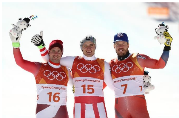
Matthias Mayer: oro in Super-G come in Discesa a Sochi.