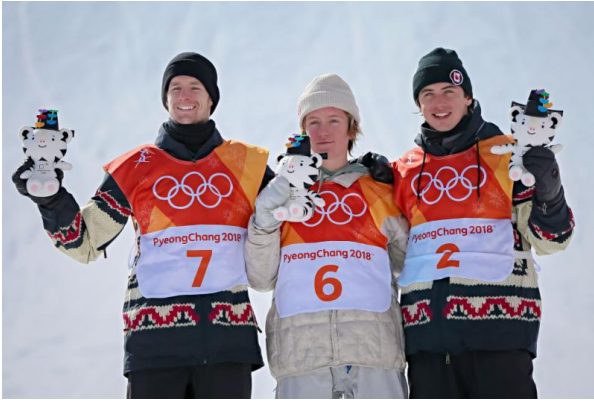
Prima medaglia d'oro degli USA su una coppia canadese.