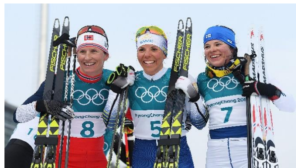
Il primo podio di PyeongChang 2018.